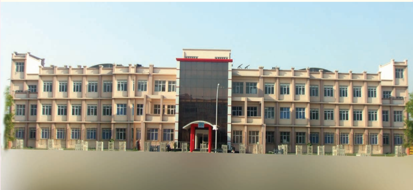
Centre for Biotechnology